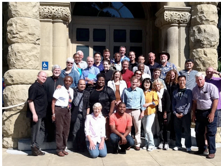
Assembled classmates and faculty of the Advanced Pastoral Studies program, San Francisco Theological Seminary at the end of summer sessions July 2011.