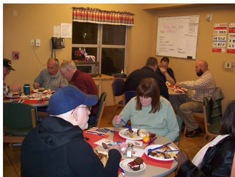
Hands On Compass Center Veterans Day Dinner.