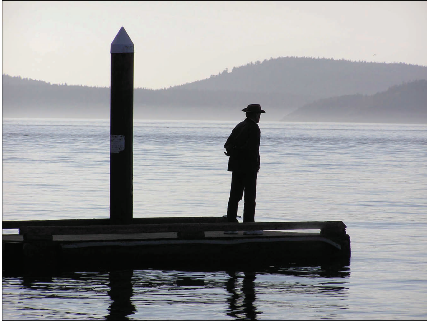
Reflecting on the Water