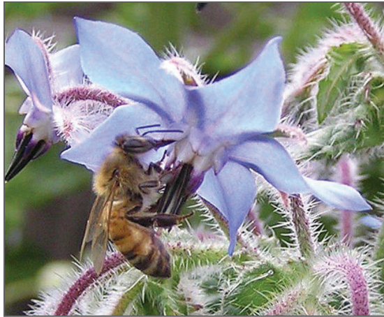
Bee on Borage

The remainder of the meeting was devoted to "continuing the conversation" begun at the Vestry Retreat. We will be having this time set aside each month to look at and find ways to make St Alban's a church for all ages.