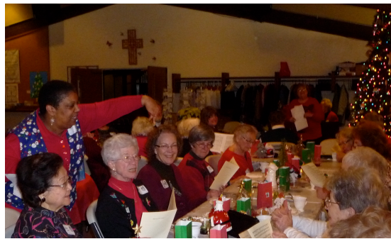
Group singing 'Twelve Days of Christmas'